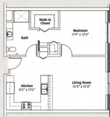
TYPICAL 1-BEDROOM UNIT